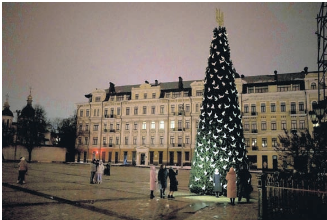
Ukrainians take photos of a newly built Christmas tree as partial power outages continue in Kyiv, Ukraine, Saturday, Dec. 17, 2022.